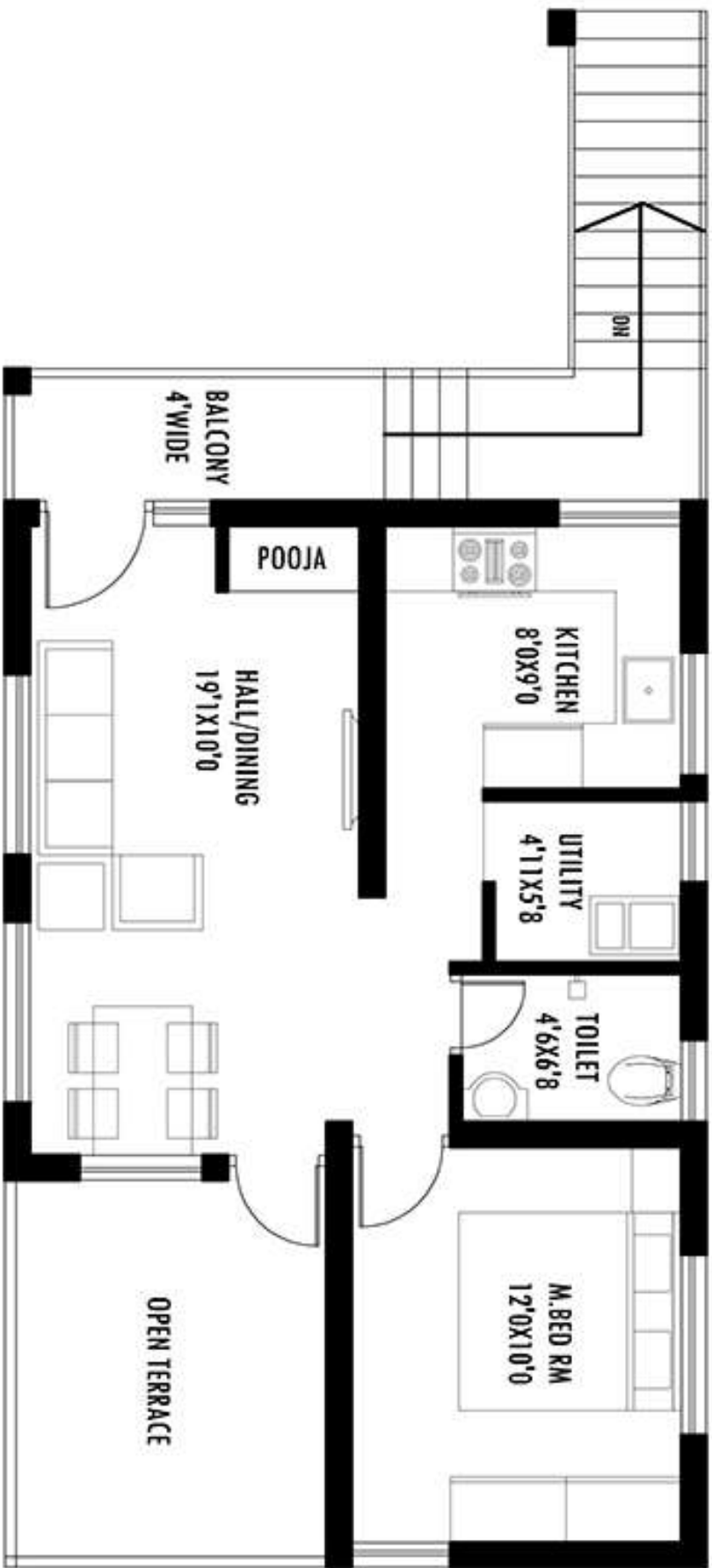
FIRST FLOOR PLAN AREA - 620 Sq ft